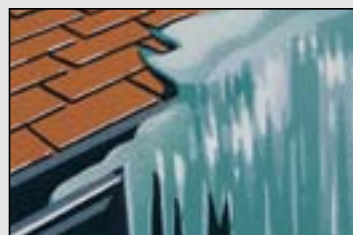
Backed up at the eaves by ice dams, melting snow finds access the same way.