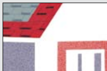
Applying a layer of Moisture Guard Plus to the deck at all rake and eave edges a minimum of 24" beyond the interior wall line will provide a last line of defense against leaks, to help prevent backed-up water from getting into the home.