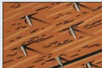
Nail holes and joints in your roof deck provide the channels for water to seep through.