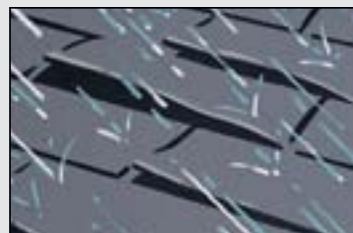
Wind-blown rain trapped under your roof's top layer seeks out those channels.