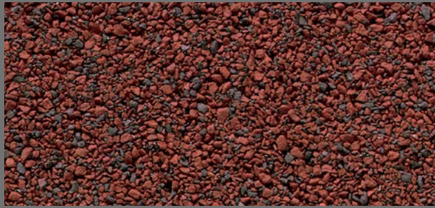
TILE RED BLEND